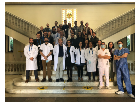
EASL School in Barcelona